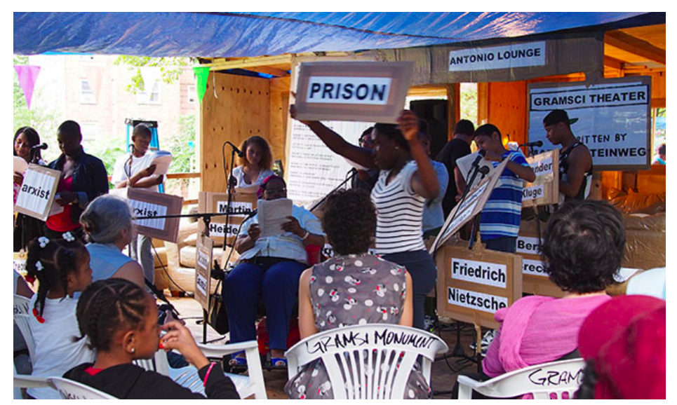
by Ben Davis Published: September 5, 2013