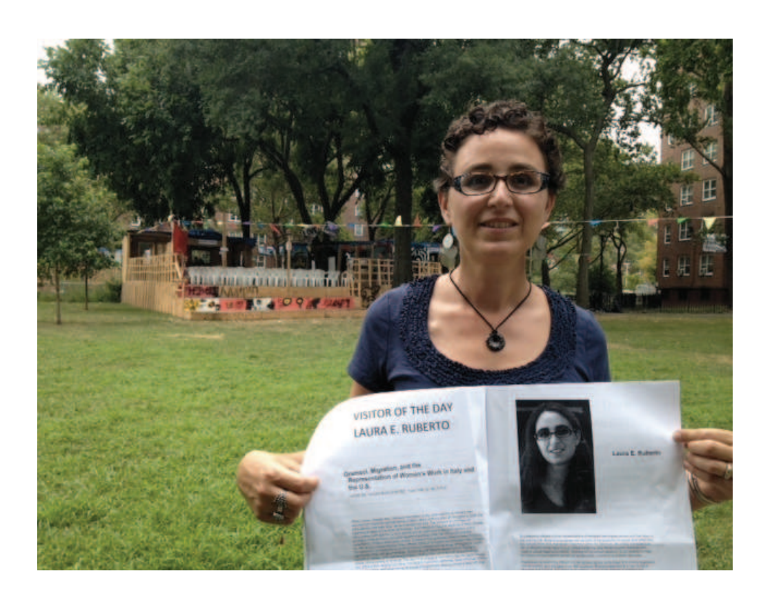
Pleasantly surprised author upon finding herself in The Gramsci Monument Newspaper (no.22, July 22, 2013)

I visited the monument on a weekday in July.